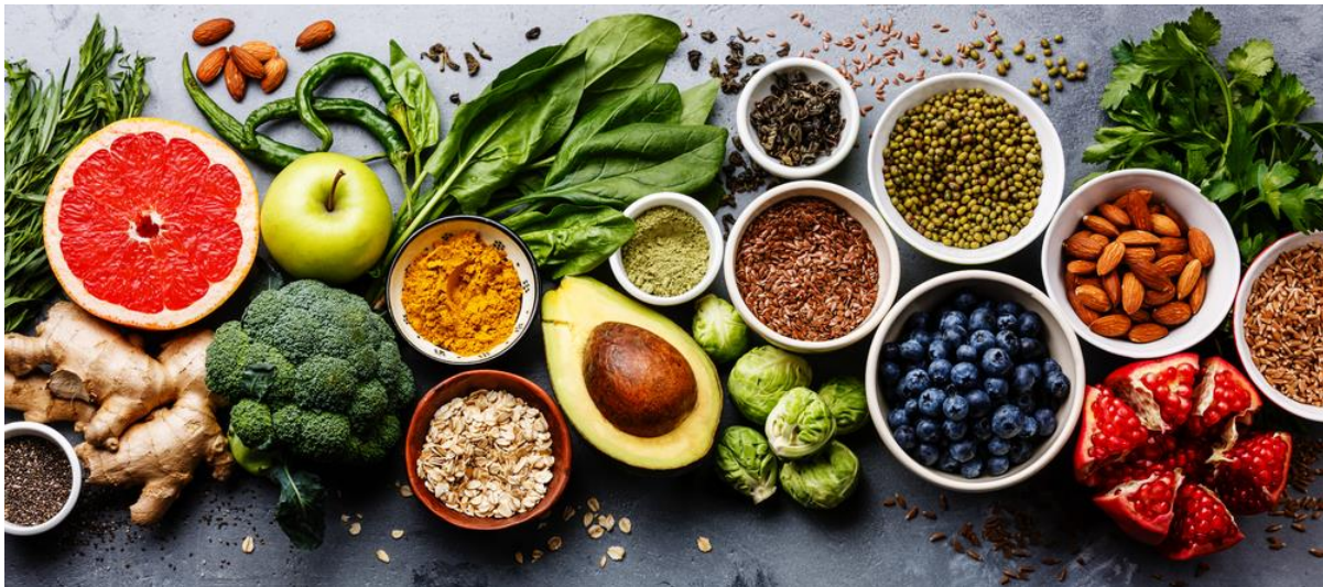
World Food Day

To learn more, visit: https://www.nfpa.org/fpw