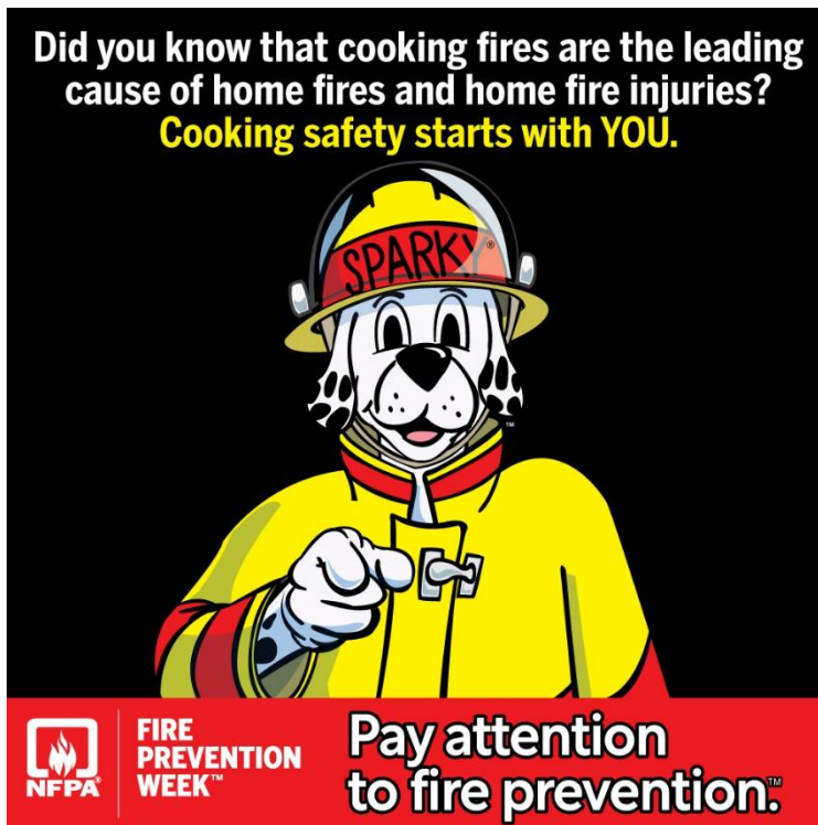
Fire Prevention Week

This week is Fire Prevention Week. The National Fire Prevention Association (NFPA) and Sparky the Dog remind families that we all must be safe while cooking. Did you know that cooking fires are the leading cause of home fires and home fire injuries?