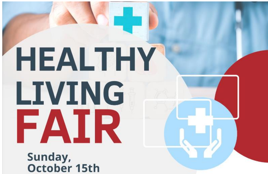
Healthy Living Fair

Sacred Heart Community Service is hosting a Healthy Living Fair on October 15 from 8 a.m. to 4 p.m. This event will be at Sacred Heart Community Service at 1381 S 1st Street, San Jose. This free fair will provide free screenings and information, including blood pressure, hearing tests, eye exams, and more.