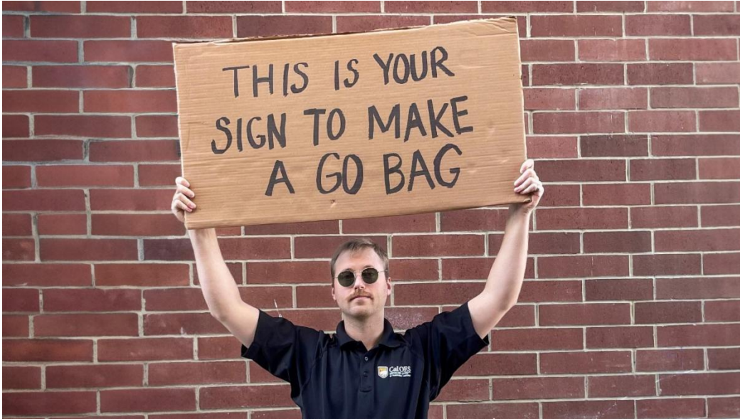
Office of the California Surgeon General Safe Spaces Training

The Office of the California Surgeon General encourages households to have a "Go Bag" in case of emergencies.