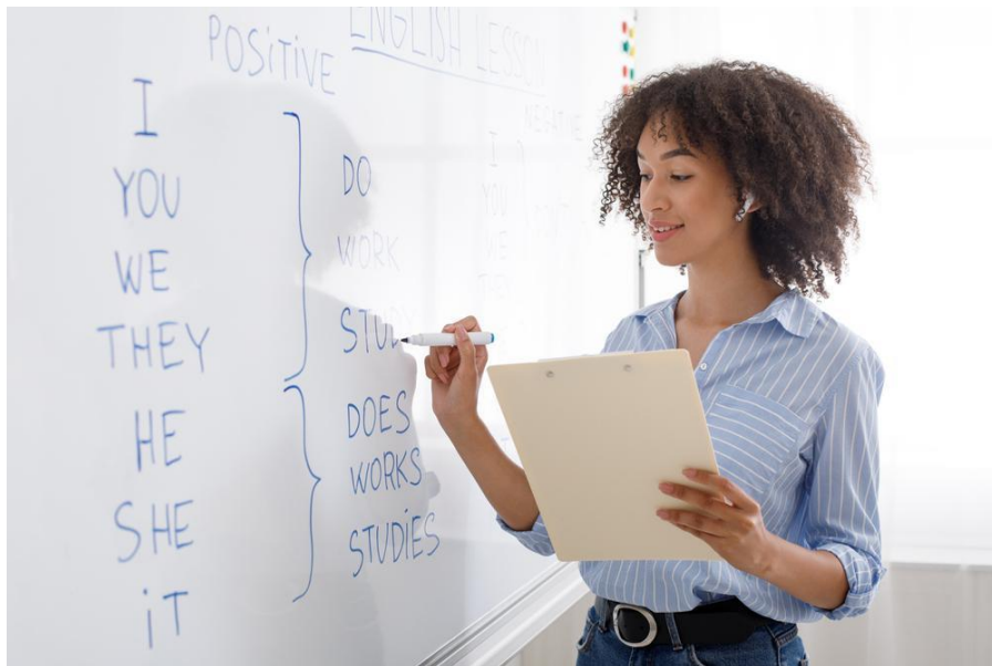
Opportunities to Practice Conversational English

To learn more, visit: https://www.parks.ca.gov/?page_id=30666