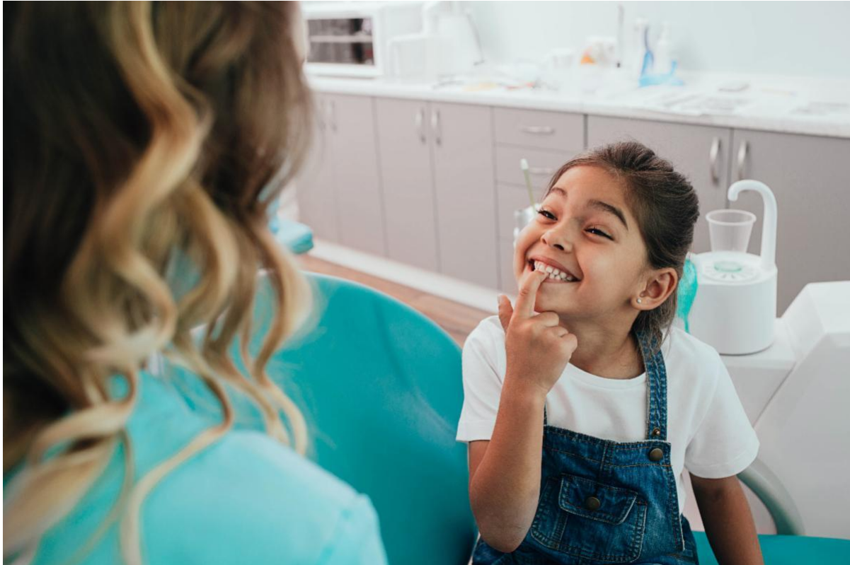
Find a Dentist

To learn more, visit: https://sprc.org/lgbtqia2s-youth-resources/