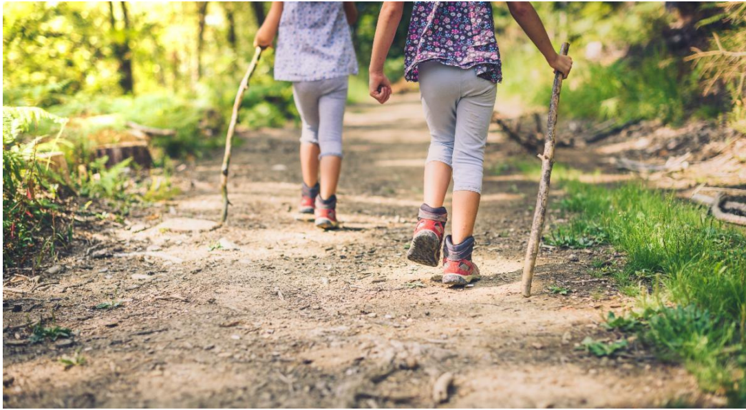
California State Parks Adventure Pass

This school year's fourth graders can sign up for the FREE California State Parks Adventure Pass! The Adventure Pass is good for free day-use entrance to 19 select California State Parks for 4th graders and their families and is valid until August 31, 2024.