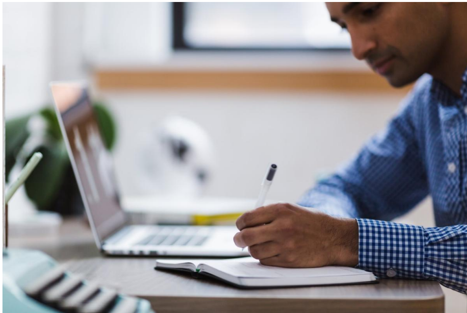
Foundations of Equitable Grading