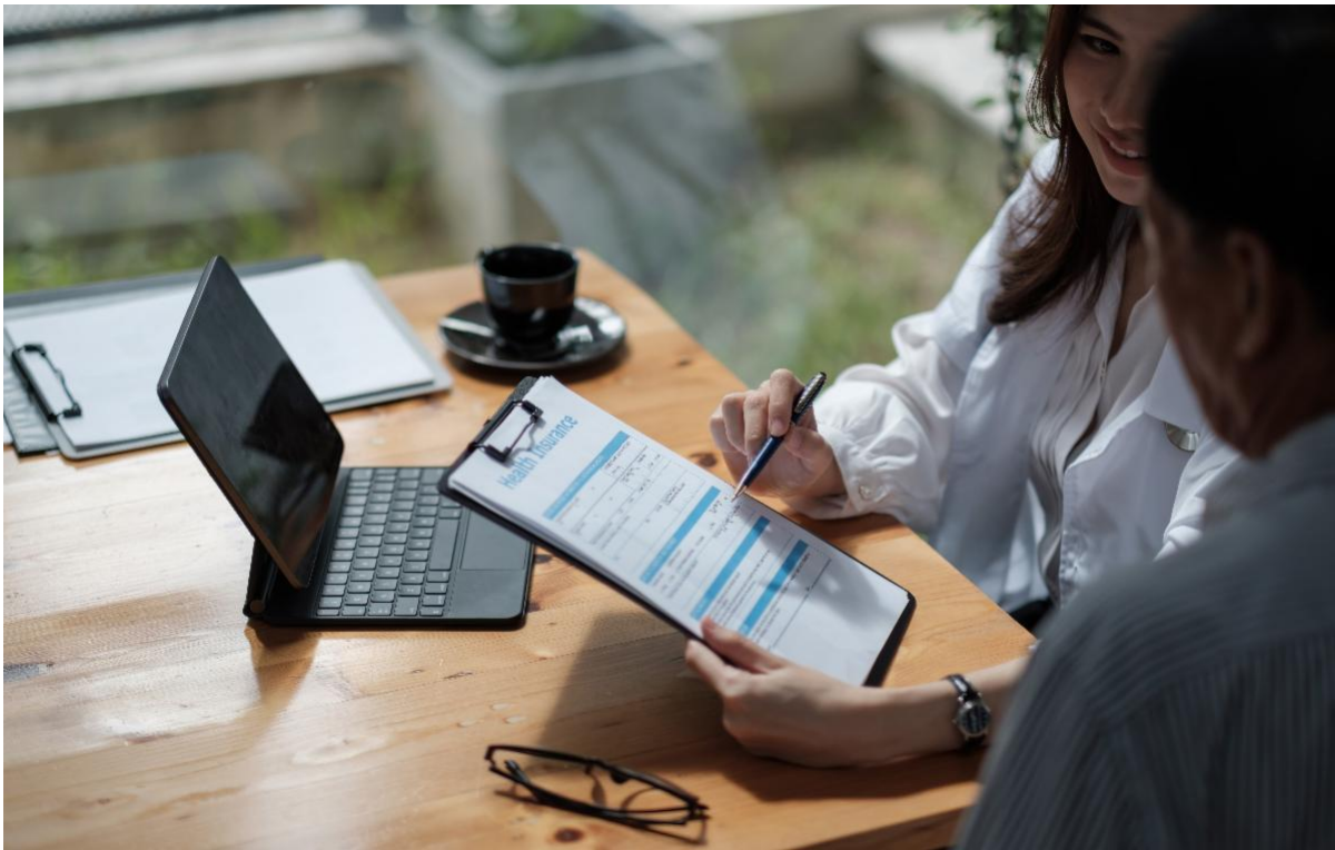
School-Based Billing Training

The SCCOE invites school-based billing coordinators and other LEA staff involved or interested in school-based billing to join their virtual learning network. In this monthly session, attendees can gain insight about different programs and billing models, understand the steps to develop and implement a school-based billing program, and more.