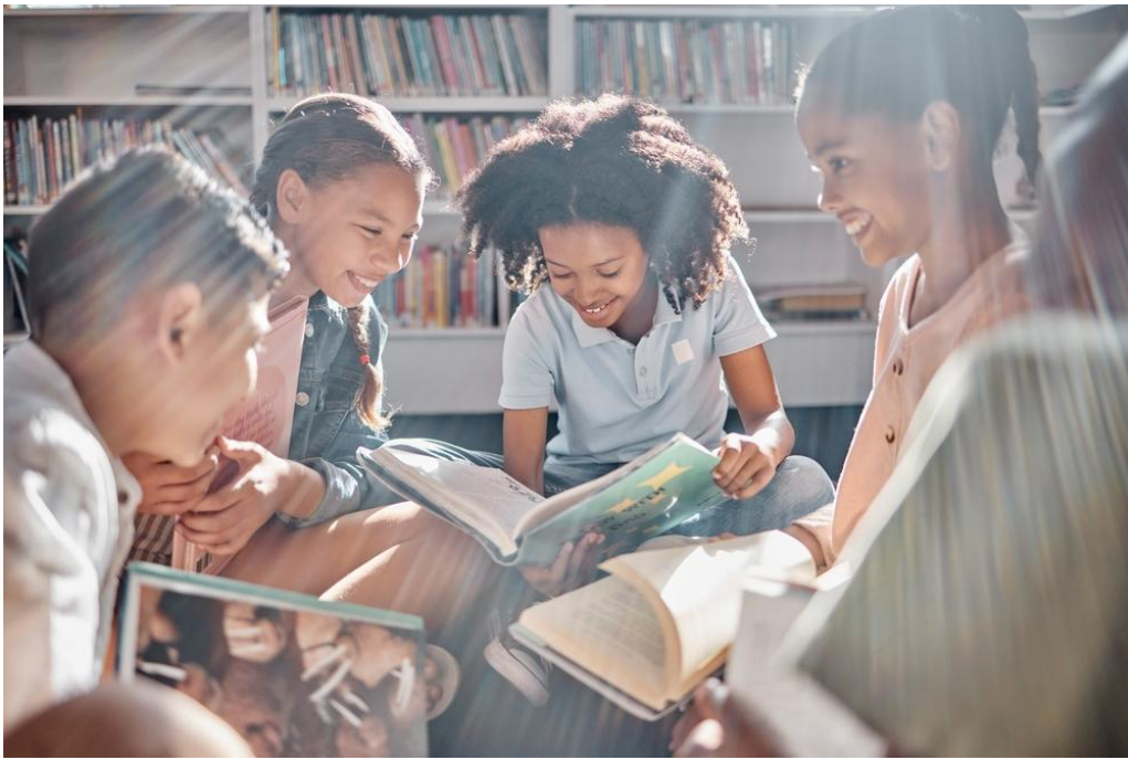
Family Literacy Month

November is Family Literacy Month, an opportunity for families to build and practice reading habits. Library cards are a valuable resource for families to access books and other reading materials at no cost. There are added benefits of having access to an online-only library of books and a variety of in-person events.