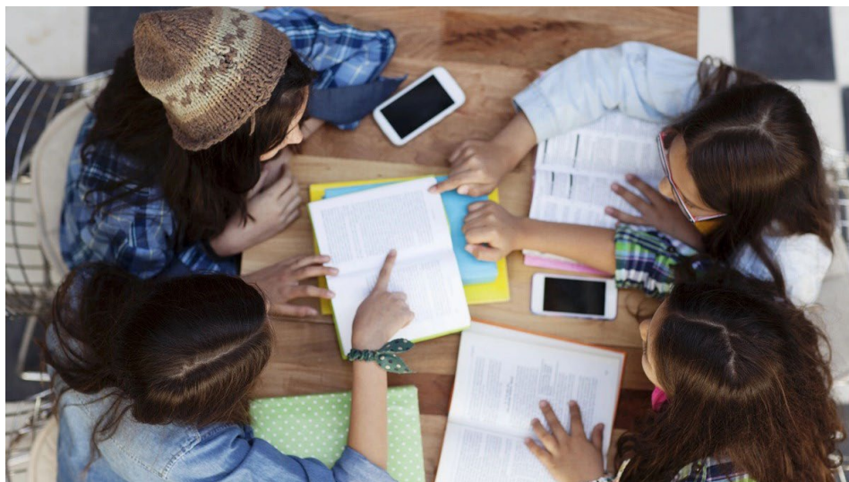
Unlocking Student Success

To learn more or register, visit: https://sccoe.to/TOSAICnetwork