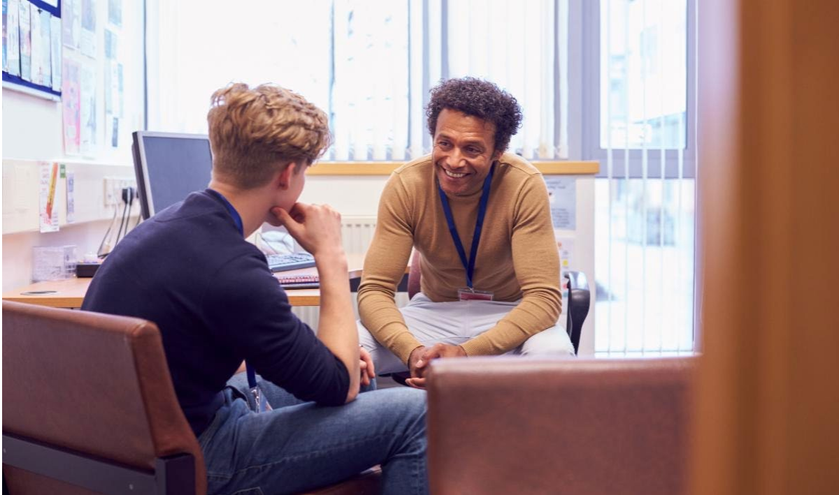
Suicide Prevention Training Series

The County of Santa Clara Behavioral Health Services Department and the HEARD Alliance will host a K-12 Early Intervention and Suicide Prevention Training series. K-12 school-based professionals are invited to attend this virtual event. The next training is for adolescents and will be on October 26 from 10 a.m. to 11:30 a.m. or 3:15 p.m. to 4:45 p.m.