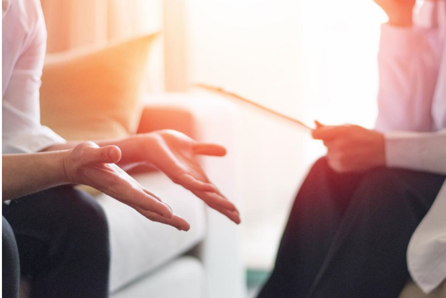
Educator Workforce Pathways

Interested in a career in education but unsure of the first steps? Our Educator Workforce Pathways (EWP) advising program is a resource to help you determine your career pathway. EWP's advising program is designed to support individuals at every stage of their career journey. Whether you're just starting out or looking to make a career switch, our dedicated advisors are here to guide you.